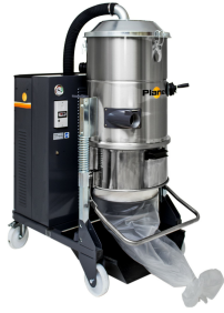
Planet Longopac® "Endless" Collection System