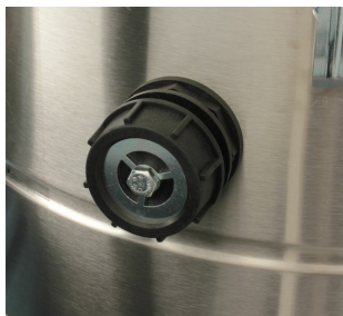
Planet Vacuum Relief Valve (VRV)