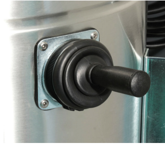
Side Mounted Manual Filter Shaker