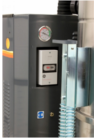
Planet Filter Blockage Indicator Gage. Manual Starter with Overload Protection