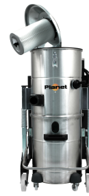
PLANET 740S & 740S MB Polyester Filter Cartridge - Included