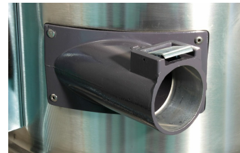
Tangential Suction Inlet, 70 mm, Aluminum