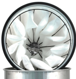
Star Shaped Polyester Main Filter