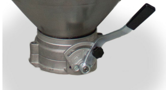
Gate Valve 8" - Included