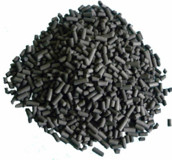
Activated Carbon Pellets - Included