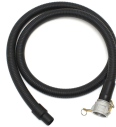
Kanaflex Suction Hose Assembly - Included