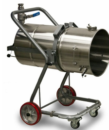
Tilting Cart Assembly