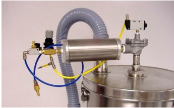
Automatic Reverse Purge Cylinder - Included