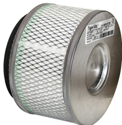
HEPA Filter - Included