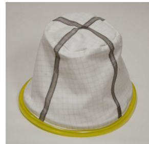
Main Cloth Filter, Static Dissipative - Included