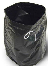
Conductive Polyliner Recovery Bag - Optional