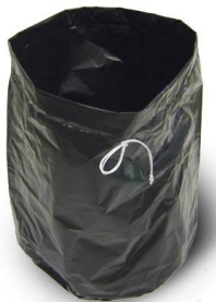
Conductive Polyliner Recovery Bag - Optional