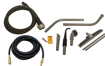
Ø1.5" (Ø38 mm) Static Dissipative Tools and Accessories (Pneumatic) - Included