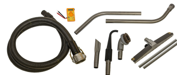
Ø1.5 (Ø38 mm) Static Dissipative Tools and Accessories - Included