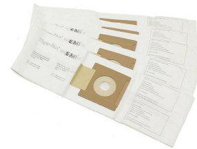
Disposable Filter Bag - Included