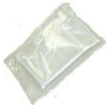
Clear Polyliner Recovery Bags - Included