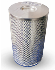
HEPA Filter - Optional