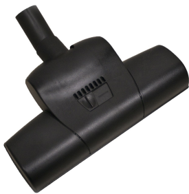
Beater Bar - Optional