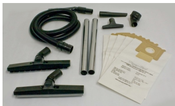
AS-10 Tools and Accessories (Wet & Dry) - Included