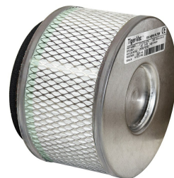
HEPA Filter - Included