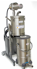
SS-IT (85L) EX (CFE) HEPA with Recovery Tank removed