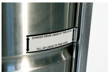
Liquid Level Indicator Tube - Included