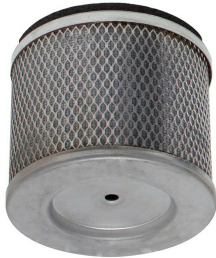
Coalescing HEPA filter (Upstream) - Included