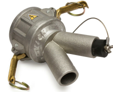
Wye Connector - Included