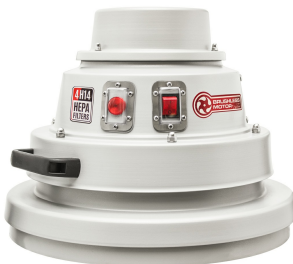
Longer Life Brushless Motor Available (always with 4 x H14 HEPA filters)