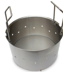
Sieve Basket - Included