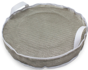
Mist Arrester Pack - Included