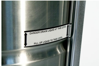
Liquid Level Indicator Tube - Included