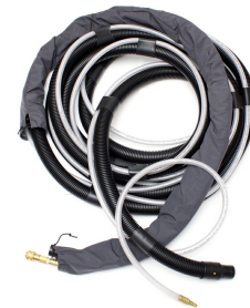
Suction/Airline Hose Assembly, Static Dissipative and Conductive - Included