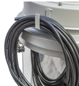
Cable Holder Hook included on the side of the powerhead