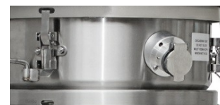
Degassing Vent - Included