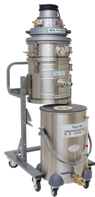
C-10EX (IT-63L) CFE SK HEPA with Recovery Tank removed