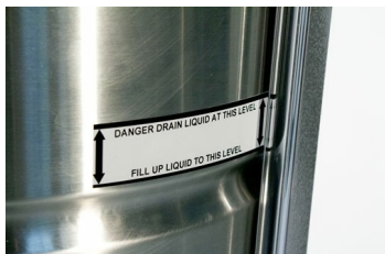
Liquid Level Indicator Tube - Included