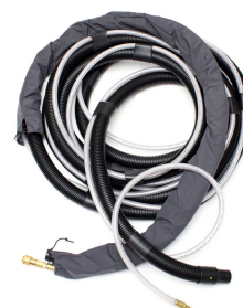
Suction/Airline Hose Assembly, Static Dissipative and Conductive - Included