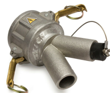
Wye Connector - Included