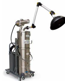
Optional Dust Extractor Arm