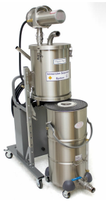
SS-IT (85L) EX (CFE) HEPA with Recovery Tank removed