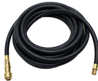
Air Supply Hose Assembly, Static Dissipative and Conductive - Included