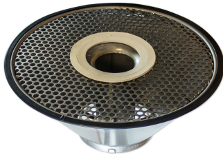
Cone for Interceptors - Included