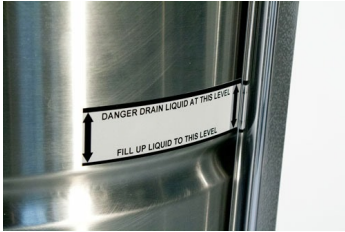
Liquid Level Indicator Tube - Included