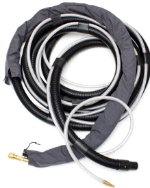
Suction/Airline Hose Assembly, Static Dissipative and Conductive - Included