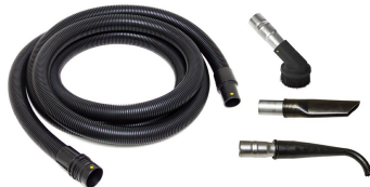
3D Tool Kit for 60 mm suction inlet - included