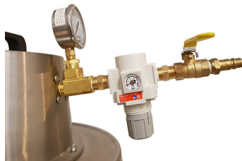
Pressure Regulator - Included