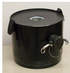
Safe containment canister - Included