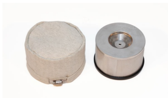
HEPA Filter with Safety Filter - Included