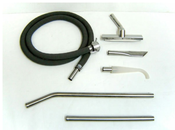
#323604 - Ø1.25" (Ø32 mm) Autoclavable tools and accessories (Kit #3) - Optional