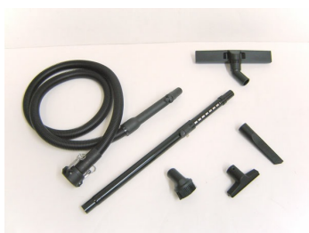
# 323600 - Ø1.25" (Ø32 mm) Standard Tools and Accessories (Kit # 323602 - Ø1.25" (Ø32 mm) ESD safe tools and accessories (Kit #1) - Optional