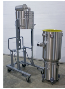
CD/EUR-50L EX DT with Recovery Tank and Filter Chamber removed