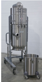
CD/EUR-50L EX DT with Recovery Tank removed