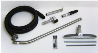
Ø2" (Ø50 mm) Static Dissipative Tools and Accessories - Optional