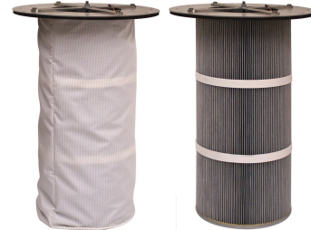
Conductive Aluminized Spun Bond Reverse Purge Cartridge (shown with and without optional skirt) - Included