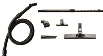
A complete tool kit is included (Part No. 323495)