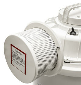
#214860 HEPA/ULPA Filter Protector/Housing Kit - Available