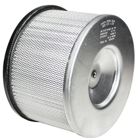
ULPA Filter for CR-1 ULPA - Included