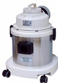
CR-1 ULPA with Stainless Steel Recovery Tank