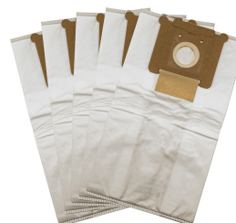
A package of 5 synthetic recovery bags is included (Part No. 212500)