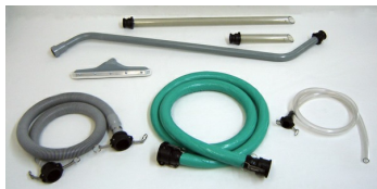
ARU STD Tools and Accessories - Included