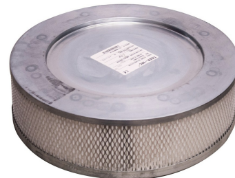
HEPA Filter - Optional