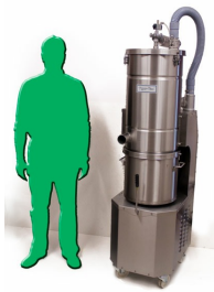
CD-2600 Next to average sized man