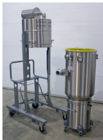
CD/EUR-50L EX DT with Recovery Tank and Filter Chamber removed