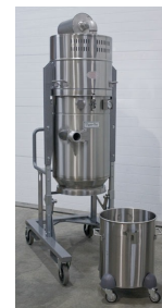
CD/EUR-50L EX DT with Recovery Tank removed