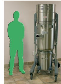
CD/EUR-50L EX DT next to an average sized man