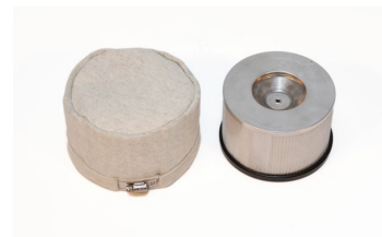
HEPA Filter with Safety Filter - Included