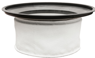
Main Cloth Filter - Included