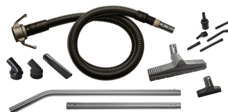
# 323602 - Ø1.25" (Ø32 mm) ESD safe tools and accessories (Kit #2) - Optional