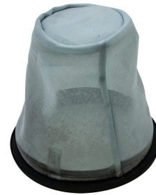
Liquid Filter - Included