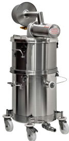
SS-10/15 CR (MRAC)