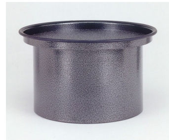
Activated Carbon Cartridge - Optional