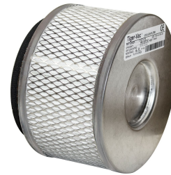
ULPA Filter - Included