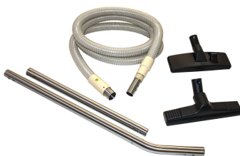
MV-1CR Tools and Accessories - Optional