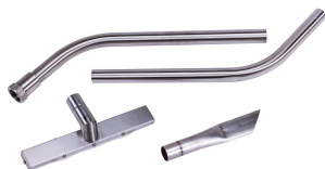
LARU Tools and Accessories - Included