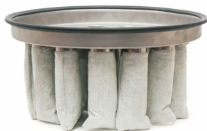
Filter Tubes Assembly for MRPFT models - Included