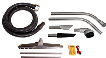
CD-120V/230V Tool Kit - Included