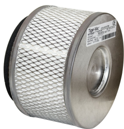
ULPA Filter - Included