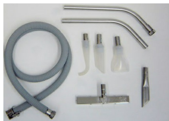
Autoclavable Suction Hose and Accessories - Optional