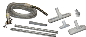
CWR Tools and Accessories - Included