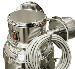
CWR-8 (4W) Cable Holder Hook - Included