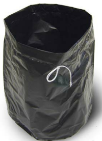
Conductive Polyliner Recovery Bag - Included