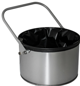
C-10EX DT (MFS) Recovery Tank and Poly Liner