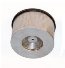
Upstream HEPA Filter - Included