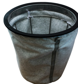
Main Cloth Filter and Cage, Static Dissipative - Included