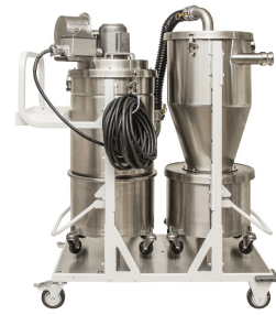
EXP1-20 DT (PRS-HEC) RE HEPA Sideview 2