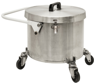
Extra recovery tank with lid to facilitate the refresh and re-use of the recovered powders (Part# 223001-ASM1) - Optional