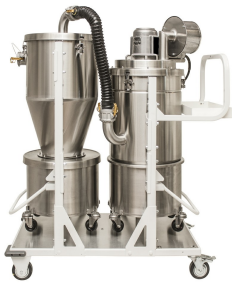
EXP1-20 DT (PRS-HEC) RE HEPA Sideview 1