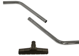
Optional 3D Tools