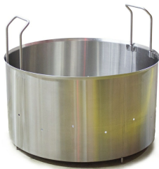
Sieve Basket - Included