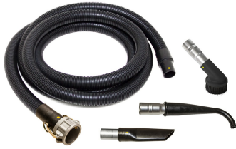
3D Tool Kit for 2" camlock suction inlet - included