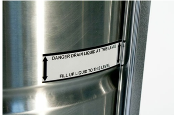
Liquid Level Indicator Tube - Included