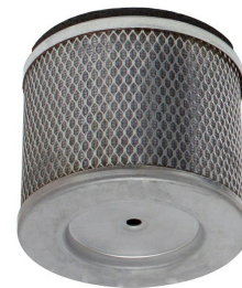
Coalescing HEPA filter (Upstream) - Included