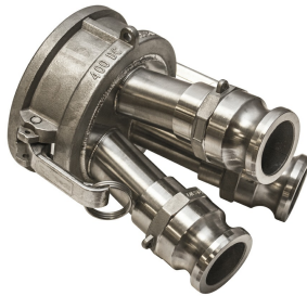
#990062 - Stainless Steel 4-Way Connector, 4" Female Camlock with 3 x 1.5" Male Camlocks - Optional