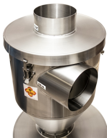
#112301-8 - HEC-100L (4W) STAINLESS STEEL w/8" Inlet and Outlet