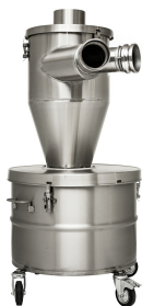
#112301A HEC-100L (4W) STAINLESS STEEL with 6" outlet and 4" camlock Wye suction inlet