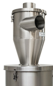
#112301C - HEC-100L STAINLESS STEEL w/6" Inlet and Outlet