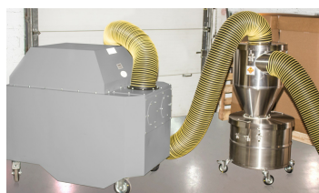
HEC-100L (4W) STAINLESS STEEL w/8" Inlet and Outlet in conjunction with CD-1200 EX Portable Dust Collector